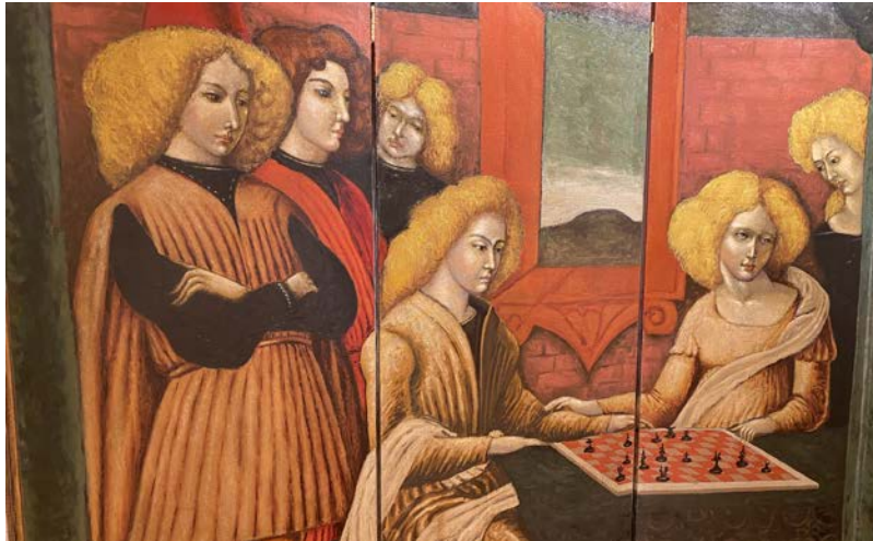
Vasyl Kondratuk, The Game of Chess , fragment, oil on canvas mounted on wood

Kondratuk's captivating artistic works, on display at the Shevchenko Museum, are emblematic of the infinite possibilities for creativity that arise from the power of unbridled imagination. According to Lyudmyla Pogoryelova, the museum's director, there has been a palpable desire to pay homage to the revered artist and the exhibition continues to generate widespread interest. "The public is invited to enjoy the artist's paintings of exquisitely attired individuals, rendered in the style of Art Deco and captured for a moment in time, as they promenade along the backdrop of Italian Renaissance façades."